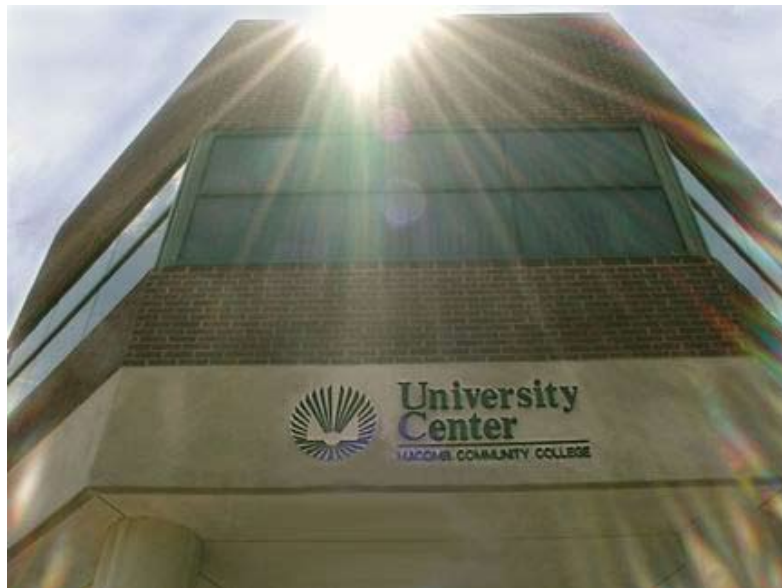
The Macomb University Center on Center Campus will serve as an expansion site of the Michigan State University College of Osteopathic Medicine as early as 2008.